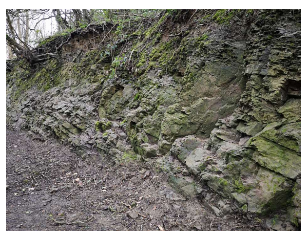
...and after geoconservation

Since its inaugural meeting on 21/03/2019 the Friends of Saltwells Nature Reserve has gained formal status which enables the community to apply for resources. This group originates from the 'Save Our Saltwells Nature Reserve' campaign group set up in October 2018 to oppose a planning application for 9 houses to be built in the middle of the woodland. In December 2018 the planning application was refused, resulting in a clear example of community success. However, once a planning application is refused, there is a period of 6 months to appeal, which establishes the deadline on the 06/05/2019.