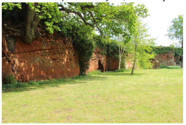
Scar Cottage Quarry

The local landscape is relatively low-lying and undulating with isolated ridges, masking a varied geological sequence and complex deformational history. To the north and north-west are the green tree-covered slopes of Penny Hill, Woodbury Hill and Abberley Hill. To the south-west lies Berrow Hill. In