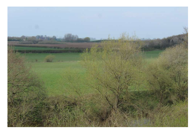
Nesscliffe - Shrawardine moraine

At Montford Bridge we saw evidence of the glacier's retreat in the form of sandy glacial till dropped from the glacier as it melted. Meltwater trapped between the retreating ice and the terminal moraine at Bicton flooded the then exposed landscape forming a glacial lake. Into this lake, sediments dropped from the retreating glacier accumulated as 'varved clays', or silt and clay with sand and gravel lenses.