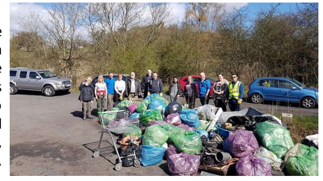
Saltwells Clean & Green litter picking group

Within the volunteer groups, I would highlight the work done by Saltwells Clean & Green, focussed on litter picking. This activity is of enormous importance because it releases the wardens backlog and enables the latter to focus on the work they are qualified to do. On 24/03/2019 the work was focussed around the Netherton Reservoir entrance to the Reserve, which doesn't belong to Dudley Council and, therefore the wardens are not allowed to clear it.