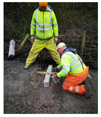
Contractors developing a path

Geoconservation tasks are a weekly routine in Saltwells, where its landscapes have gone through a transformation during the last months. After all the hard work performed within the Doulton Claypit, the work has currently moved towards a clearance of the rock faces along the tramline connecting the quarry with the canal. Every Thursday, the wardens alongside the volunteers perform different conservation tasks targeting the geology. In addition, TCV undertake tasks on Tuesdays with increasing numbers of volunteers due to partnerships with Merry Hill Shopping Centre, NatWest or RBS. These partnerships constitute a win win situation, since the participants get a day out of the office, or their usual workplace, and TCV receives volunteers.