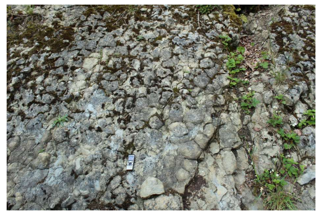
Penny Hill Quarry Limestone

Since 2011, TVGS accompanied and encouraged by local community support and through European funding, have produced initiatives aimed at making local geology more accessible to the public.