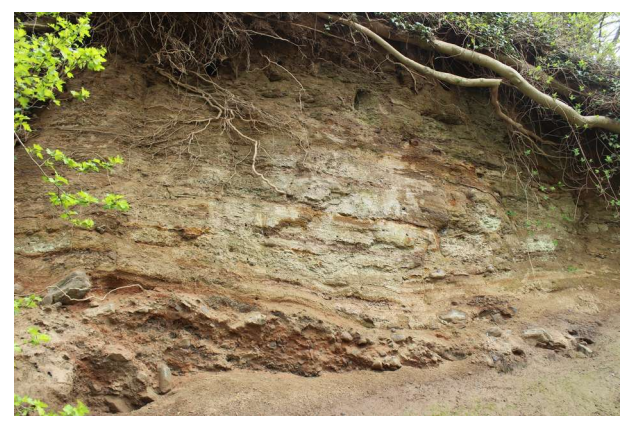
Exposure at Montford Bridge

During the last (Devensian) Ice Age an ice tongue from the North Wales ice cap (the Severn valley glacier) carved a course to Bicton. During its advance and eventual withdrawal, it left numerous sedimentary features behind, hinting at its passing. At Bicton, an elevated roughly north-south curving ridge (or terminal moraine), kettle holes, and variable clay-rich to sand-rich soils define the glacier's eastern most extent around 20,000 years ago before it began to retreat. ▶