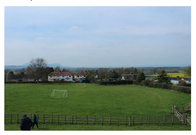
Westward view from Shrawardine Castle

We finished at Melverley Church (see front cover photo) where David pointed out various interesting features about the local surrounding landscape. Melverley Village sits on a third roughly north-south trending curved ridge – the Melverley moraine, which represents a second brief pause of the retreating glacial ice before it disappeared back into Wales. Following the glacier's departure, rivers such as the Severn and Vyrnwy carved their way through the lowlying post-glacial landscape exposing the sediments deposited within the earlier lakes. Melverley Church is a rare example of a timber church with no solid