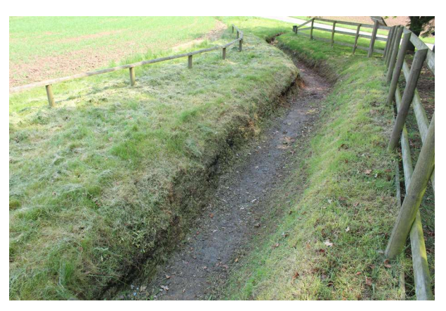
Martley Rocks Investigation Trench

Next, we stopped at Scar Cottage Quarry, situated within the privately-owned back garden of a TVGS member. However, it is only open for organised group visits. The quarry comprises exposures of redbrown, cross-bedded, channelised Triassic Bromsgrove Sandstone. The beds show evidence of fracturing, faulting and carbonate mineralisation from capillary water migrating through fractures in the rock. Historically, the sandstone was worked for building stone. However, weathered voids and collapsed blocks are testament to the rock's poor quality.