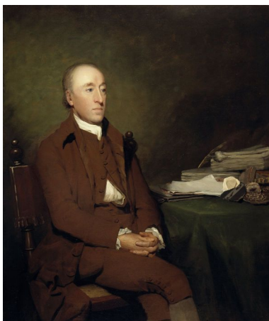
Portrait of James Hutton