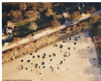
Sinkholes in Chalk

The winter of 2013 - 2014 will be remembered for many things, especially the winter storms and floods across much of the UK. However, 2014 will also be remembered as a bumper year for the appearance of numerous sinkholes. Across the UK and globally in the United States, Australia and India, the media were awash with reports of buildings, vehicles and people falling victim to the sudden appearance of sinkholes. Recently I was involved with a project near London for a proposed residential development where the potential impacts from sinkholes were a going concern.