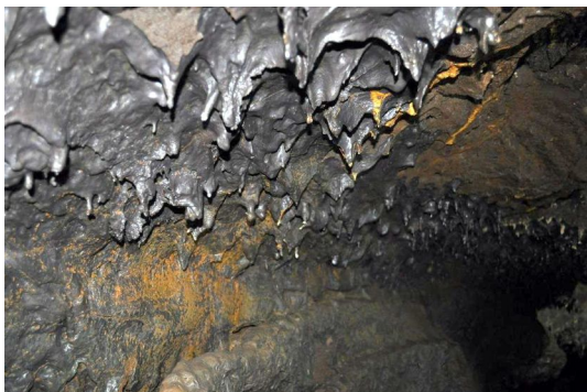
1. Lava stalactites within the Gruta do Carvao lava tube on the outskirts of Ponta Delgada

sediments containing marine fossils became exposed on land. Apart from this, all the other islands are entirely volcanic, mostly consisting of outpourings of basalt lavas, or basaltic ashes.