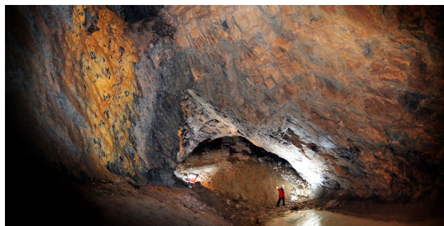
Singing Caverns

We have been carefully and sensitively discussing this initiative with some great people across the geological and Geopark communities of the Black Country, the UK, and overseas. This has been a truly fascinating and inspirational process that has guided us to the advent of our own application. We now have a distinctive brand and logo that focuses on the coal (which is amazingly abundant and at outcrop almost everywhere across the area). Our brand echoes the colours of the Black Country flag - which reflect the "country black by day and red by night": words of Elihu Burritt, the American consul to Birmingham who visited and was blown away by what he witnessed here in the 1800's, and whose heart was moved by the human cost of this. That humanity is captured in the logo too, which features a red heart. This reflects the Black Country's geographic position at the heart of England, and also the generic pride, warmth and friendliness of the Black Country peoples. In 2015 this imagery will begin to appear on a number of heritage sites and feature widely in literature. It will begin the physical process of linking places and people together across the area and across time.