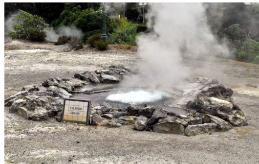
3. One of the many fumaroles in the village at Furnas

Our base on the island was Ponta Delgada, the main island town. We started with a descent into the Gruta do Carvão, on the northern outskirts of the town (see photo 1). It is a large lava-tube around 2500m in length, although the public only have access to a small section of it. Within it, there are excellent examples of lava stalactites and stalagmites, some fused into pipes.