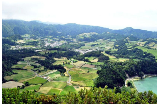
4. Looking down into the Furnas caldera with Furnas Lake to the right

Our route then took us to the western coast outside the caldera, where there have been numerous eruptions from radial fissures. Some eruptions involve the production of lava, which then flows or cascades over cliffs at the coast and builds out to form a coastal platform. One such example is at Ponta da Ferraria, where a classic rootless explosion crater has formed from lava flowing over water-saturated beach sediment below. At nearby Mosteiros, the cliff section displays layered ash deposits containing numerous lava bombs and associated sag-craters (see front page photo).