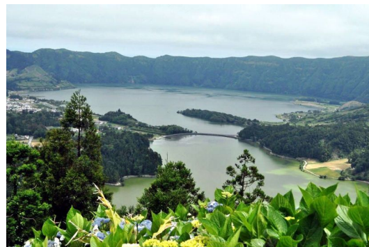
2. A view of the crater lakes within the Sete Cidades caldera and the crater rim beyond

Some scientists have recognised the existence of an 'Azores Micro-Plate', lying to the east of the Mid-Atlantic Ridge. This separates the Eurasian and African Plates, with the two faults forming its northern and southern boundaries. Evidence to support this is the fact that this supposed micro-plate forms a submarine plateau (the Azores Platform) where the ocean floor across the whole region is only 2kms below sea level, considerably shallower than the Eurasian and African Plates lying to the north and south.