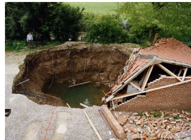
Ripon, North Yorkshire

In the UK, the sustained winter storms of 2013 - 2014 made it one of the most exceptional periods of winter rainfall in around 248 years. The highest number of sinkholes occurred after the heaviest period of rainfall in February 2014. Most events centred on the south-east and were associated with Lambeth Group strata overlying chalk within the vicinity of former brickwork sites. A 'dene' hole opening up beneath the M2 in Kent was one example of such an event. Another occurred in Ripon, North Yorkshire, which resulted from the dissolution of gypsum deposits and caused severe property damage. In the Black Country the threat of sinkholes is not so much an issue given the nature of our underlying geology - Silurian limestone, Carboniferous Coal Measures and Permo-Triassic mudstones and sandstones. The greater threat here is, and has been, the formation of crown holes from the past extractive activities of man, illustrated by the caverns and tunnels of the Wren's Nest.