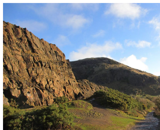
The Basalt/Dolerite of Salisbury Crags

Hutton put the results of his observations and research in a book, 'Theory of the Earth', published in 1788. Modern editions of this text are available, and it is not an easy read. It is written in a very awkward style, and you have to work hard at it. The ideas at the time said that all rocks were formed from a primeval ocean with granite the oldest sediment underlying all the others. Hutton argued that you cannot explain the formation of all rocks by sedimentation and crystallisation from water alone. Heat and fusion are required. He methodically describes geological features that must have heat for their formation: siliceous matter in granite and what he called felspar; crystals in metal ores and agates; crystals growing in cavities in igneous rocks and of course volcanoes: