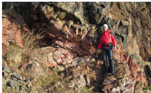
The disturbed junction at the base of the sill that Hutton recognised

'Theory of the Earth' was published in 1788, but generally went unnoticed outside Hutton's circle of Edinburgh philosophers; it was difficult to read with its awkward style. Hutton's genius was not recognised until after his death in 1797. It was then that the text was reworked by Playfair and Charles Lyell, and so modern geology took off. ■