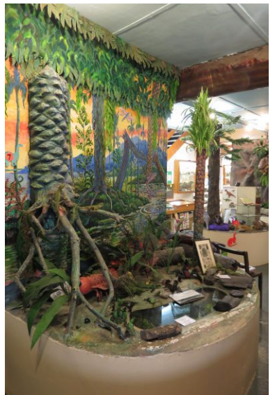
Carboniferous scene, typical of the dioramas

switched on (I was the first, and perhaps only, visitor that morning), and was left to mosey around at my own pace while the owner returned to some chore in his garden.