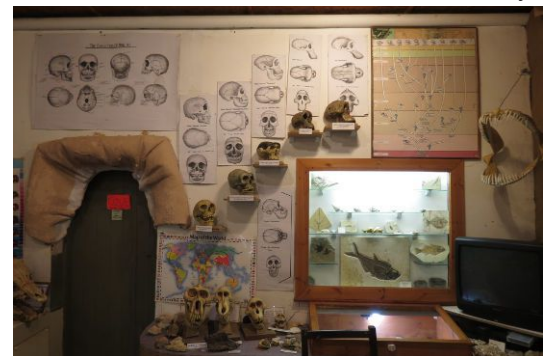
The hominid evolution display

There is no particular order to any of these displays, and you will have gathered by now that the whole museum is rather haphazard in nature. It very much represents a personal accumulation of geological (and archaeological/anthropological) material collected throughout a lifetime's hobby. However, it has been collected by someone with a clear love for, and extensive knowledge of, his subject material. A few of the reviews on-line are nonsensically negative, if not positively scathing, but most visitors seem