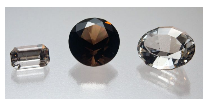
Faceted topaz and smoky quartz - Braemar Castle

The fascination of Queen Victoria and Prince Albert with Scotland's national gem, and the surviving legacy of their specimens, are explored using the Queen's personal journals and contemporary newspaper accounts, together with images of specimens from the collection at Balmoral Castle and Osborne House. A supply chain is traced from 'The Diggers' who sought raw material, through mineral dealers, lapidaries, seal engravers and jewellers who all earned a living trading 'Cairngorm stones'. The principal centres for the Scottish lapidary trade appear to have been Edinburgh and Aberdeen, but with several notable businesses also prospering in Inverness, and others in Dundee, Perth and Stirling. The story culminates in the Great Exhibition of 1851, which provided a shop window to the World for Scottish goods, including natural cairngorm crystals, and the jewellery and other artefacts fashioned from them.