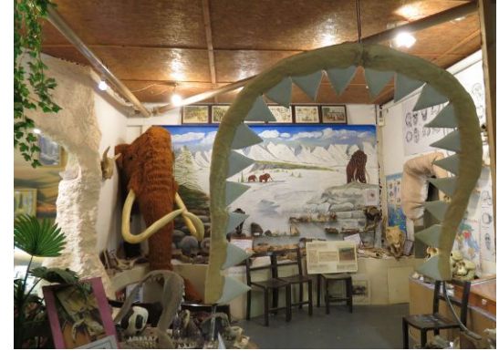
View through the 'Megalodon doorway'

These are augmented by fossil displays from various localities the owner has visited, notably Mount Lebanon (fish and plants) and the Araripe Basin in Brazil (fish). Basic rock types, minerals and their properties, how ▶