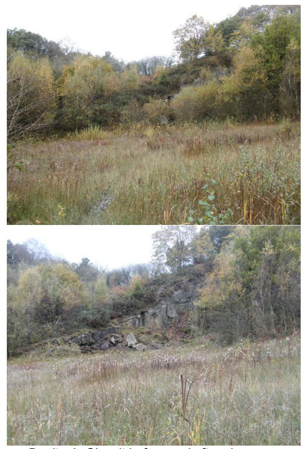
Doulton's Claypit before and after clearance

We met Alan and other reserve volunteers at the nature reserve's car park off Saltwell's Lane, on two cool, grey and damp Sunday mornings. In recent years the claypit has been somewhat