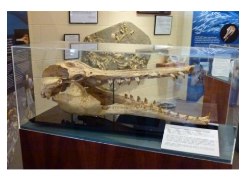
Oligocene shark-toothed dolphin

Oligocene baleen whale, partially excavated and protected in situ, giving a rare opportunity to relate a large fossil creature to its environment.