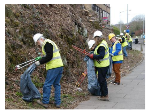
Clearance at the Rubery Cutting

The Birmingham & Black Country Nature Improvement Area (B&BC NIA) have begun supporting work to enhance the educational value of the site as one of Birmingham's most important geological exposures. They are a partnership of 50