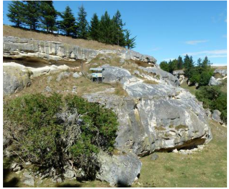
Site of Oligocene baleen whale

besides. We spent a very happy few hours there, and would highly recommend adding the trail and museum to your itinerary if you are considering a visit a visit to New Zealand's South Island. See: www.vanishedworld.co.nz/