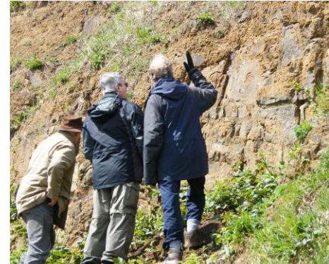
Blue Rock Quarry, Rowley

After lunch we headed to St. Brades Road, in Rowley Regis, where we were luckier with the weather. Our visit was to the former Blue Rock Quarry, where we had undertaken clearance work in February 2013. Although the exposures were clear of vegetation, a thick carpet of nettles, brambles and undergrowth was already beginning to appear. The yellow gorse, home to the Green Hairstreak Butterfly, was also in full flower.