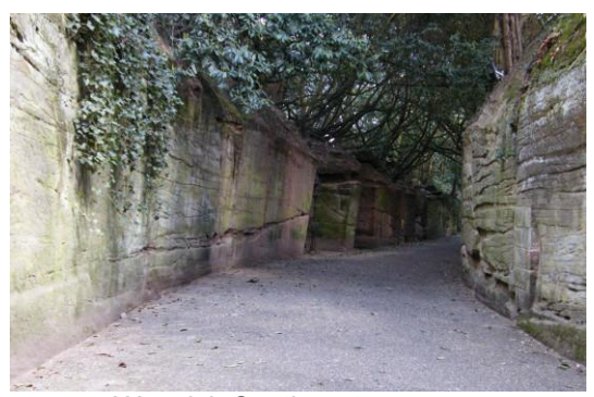
Warwick Castle entranceway

House, being restored with stone from North Woodloes Quarry, to Warwick Castle. The entranceway to the castle is cut through Bromsgrove Sandstone and within the exposures can be seen excellent examples of current cross bedding. In places the yellow brown colour of the Bromsgrove Sandstone gives way to red brown staining, the result of iron oxide leaching from the overlying Mercia Mudstone strata. Unfortunately, the easy-to-work Bromsgrove Sandstone is susceptible to the destructive activity of masonry bees that like nothing better than to burrow into the sandstone to build their nests. The evidence of their damage was quite apparent within some of the sandstone blocks within the castle