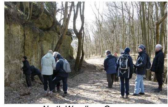
North Woodloes Quarry

This is a small quarry and at the time of our visit was being worked to supply stone for repair works to Warwick Court House, in Warwick town centre. The quarried stone is yellow-brown Triassic Bromsgrove Sandstone, which has been extracted and worked as a local building stone for some time. The Bromsgrove Sandstone sits at the top of the Sherwood Sandstone Group and appears to have been deposited under shallow deltaic conditions. Down through the Sherwood Sandstone Group sequence, in Warwickshire, the