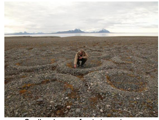
Svalbard permafrost stone rings

Water's expansion on freezing is 10% by volume. The linear expansion is only 3%. A frost heave of 1 inch would correspond to a frost penetration of some 30