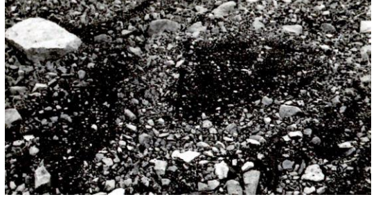
North Iceland, July 1963, Gordon Hensman

These develop along the margins of ice sheets where total annual precipitation - almost entirely snow - is generally light to moderate, allowing the deep penetration of frost, sometimes to depths of hundreds of