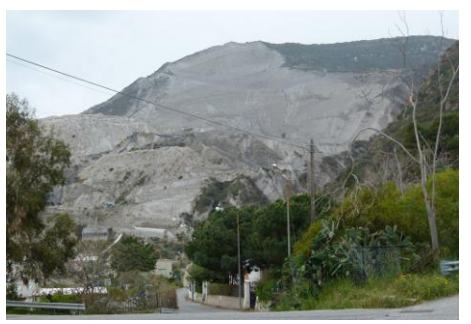
Pumice quarry on the island of Lipari

Lipari emerged from the sea around 200,000 years ago, and has erupted magmas of most typical Aeolian types. A trip around the island focussed on the north eastern corner, scene of the most recent activity. Here, the rhyolitic Monte Pelato has been built entirely within the last 10,000 years. A late explosive phase produced a vast pumice cone, followed by flows of obsidian lava, and both of these products have been exploited commercially for many centuries. The old pumice quarry workings extend high up the mountain side, and in a roadside cutting we saw some spectacular flow-banded and 'snow-flake' obsidian in various stages of devitrification.