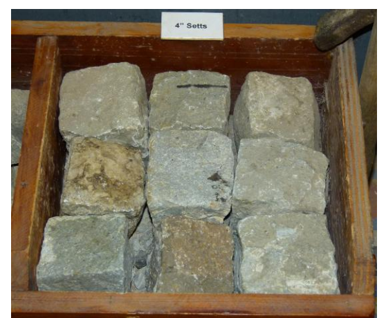
4 inch setts at Threlkeld Museum

Threlkeld Quarry and Mining Museum lies in the long sweeping valley between the towering mass of Blencathra and the micro-granite intrusion of Threlkeld Knotts, close to Keswick in the Lake District. What, you might ask is the connection with Rowley Rag?