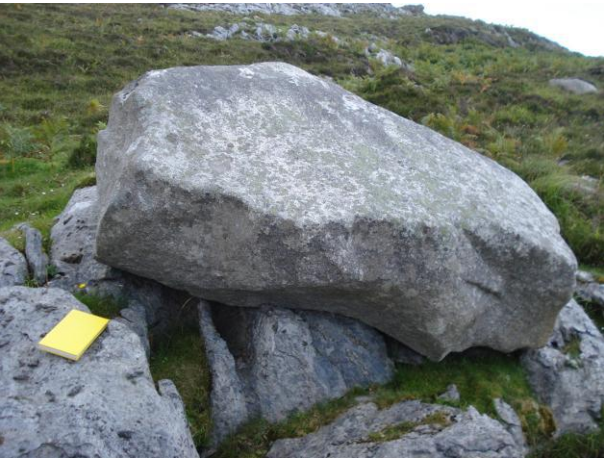
Granite glacial erratic on dolostone deposits on the Isle of Skye

The meltwater within a glacial landscape forms a number of landforms including eskers (long narrow ridges of sorted sands and gravels), kames (deposited on the edges of glaciers) and