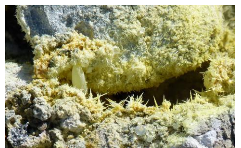
Needle-like sulphur crystals

The Fossa volcano is the product of a number of cycles of activity, and last erupted in 1888-90. The cone is made up of layers of ash, surge and flow deposits, and some huge 'breadcrust bombs' scattered around the rim bear witness to the intensity of the explosions which characterised that eruption. The throat of the caldera is blocked, but there is activity on the northern rim where a