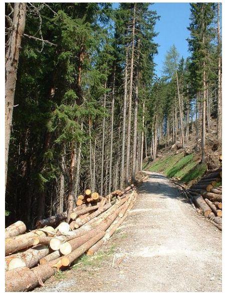
Forestry work in Austria, Photo by Queryzo, Wikimedia Commons.

source of central heating to buildings and houses in the communities close to the sawmills. This system also provides much needed employment in northern latitudes by utilising the vast natural resource of the forest.