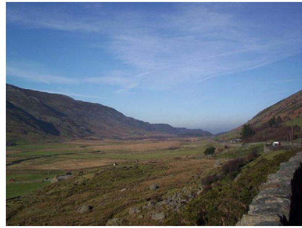
Nant Ffrancon Valley, Snowdonia

Hanging valley: A neighbouring valley which once had a smaller glacier joining one of a larger volume