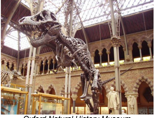
Oxford Natural History Museum

After the doors had closed to the public, the afternoon ended with an excellent buffet in the surreal surroundings of the museum exhibits, with the drinks table set disconcertingly under the gaping maw of