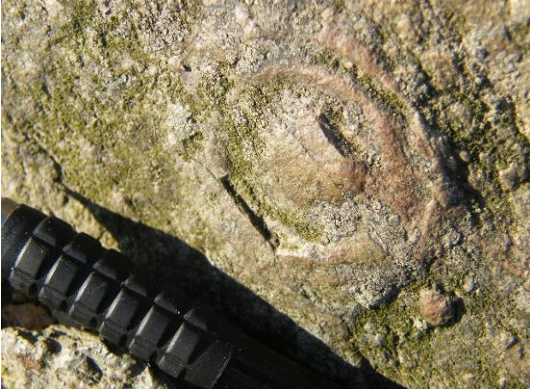
Precambrian holdfast, Bradgate Park

All the Precambrian/Cambrian rocks of the Charnian Supergroup appear to have a volcanic origin, as volcanic bombs, tuff, or ash deposited on relatively gentle volcanic slopes. Some of these deposits also show evidence of interaction with water suggesting that either they were deposited in shallow water or were transported there later. It is believed that the volcanic source of these rocks was close and towards the northwest. Towards the west (Whitwick) and the >