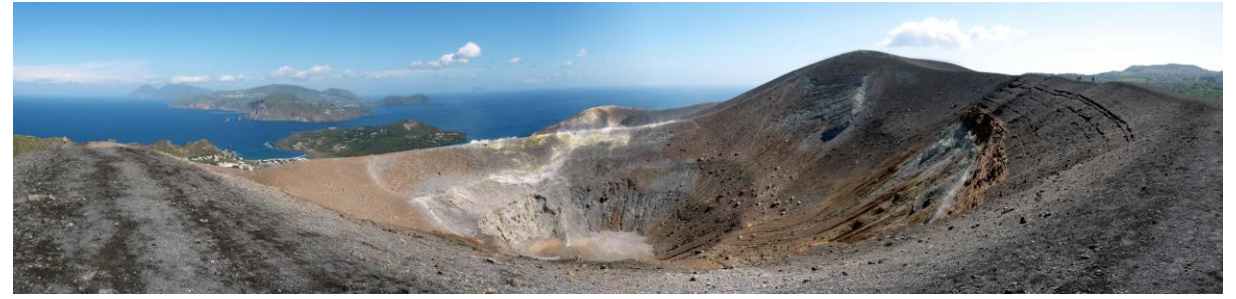
Vulcano's active Fossa cone, looking towards Lipari

Though unimpressive in height, Vulcano has a deadly history and worryingly unpredictable future, amply justifying its distinction as the original namesake of all the world's subaerial magmatic >