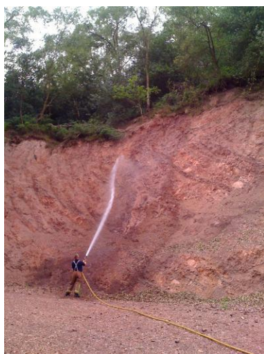
Help from the fire brigade at Barnt Green Road Quarry

I am one of the Champions for the Warren Lane and Barnt Green Road Quarries in the Lickey Hills. The Warren Lane quarry is used as a depot and is not permanently open, but the Barnt Green Road Quarry is our pride and joy, and one of the 'jewels in the crown' of the entire Champions project. Unlike some of the Champions groups, we played no part in the initial site clearance. This was a major undertaking involving the use of heavy machinery and the fire brigade to clean the rock face, and it has been largely due to the interest and close co-operation of the Lickey Hills Park Rangers that the project has proceeded so smoothly.