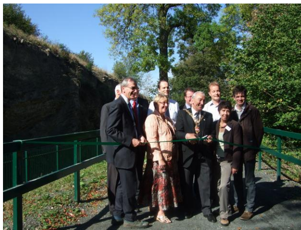
The Mayor cuts the ribbon at the 'Ripples through Time' launch

In terms of the science here we have made a few steps forward but there are still many puzzles to be solved about the rocks of the Wren's Nest and the ancient world in which they were formed. A few things that we have learned in the last couple of years though, which readers might be interested in I've outlined below.