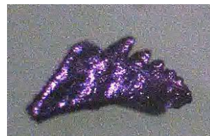
Scolecodont jaw found in the Step Shaft Rocks

These samples have been sieved and picked through in great detail in the laboratory at the museum and have yielded tiny fossil treasures that we had no previous knowledge of. In particular a vast array of tiny (less than a tenth of a millimetre long) jawbones of fossil worms have been discovered. Most appear never to have been discovered or described by science before. Scientists call these things scolecodonts and I am now working with fellow scientists in Prague, USA, Sweden and Denmark to understand more about these beasties and how they changed through time.