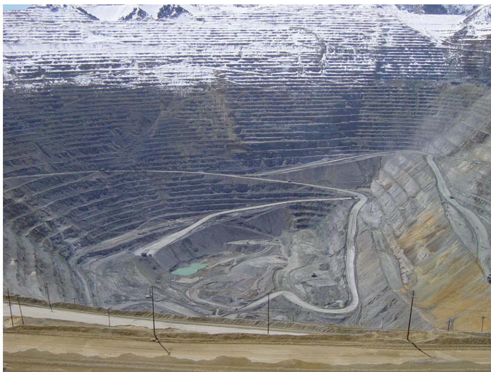
The huge Bingham Canyon Copper Mine, Utah

Today we use metal for practically everything such as transport, electricity and buildings. Over the last 50 years, uses and demand for metals has increased, which is due to their properties. The most common metals we use in today's modern society include copper, aluminium, iron and steel. Less common metals include gold and silver.