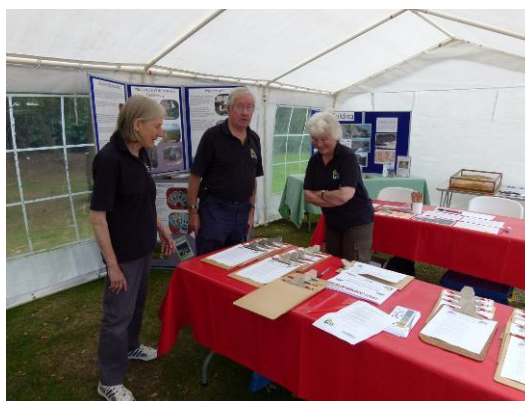
Lickey Champions at the launch event

We were very proud that the Lickey Hills Champions project was selected by The Geological Association as a flagship site for a field visit during its recent 2 day meeting to discuss 'Geoconservation for Science and Society: An agenda for the 21st Century'. The delegates seemed very impressed, particularly with the well-managed public involvement, which will enable the Champions to proceed with confidence once the H&W EHT life-support system is withdrawn.