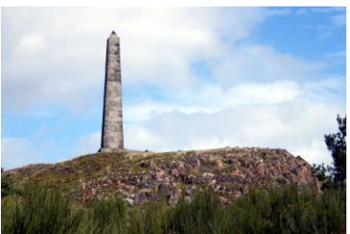
Monument Hill, Lilleshall

We encountered Pre-Cambrian rocks behind the village hall and on Monument Hill. They comprised purple, pink and orange rhyolite tuffs and breccias associated with the Uriconian Volcanics (Eastern Uriconian Group), for which Lilleshall is apparently the type area. The Group forms a series of hog backed hills, or inliers, along the line of the Church Stretton Fault, and include Ragleth Hill, the Lawley, Caer Caradoc, the Wrekin and Ercall Hill at the northern end of the Coalbrookdale Coalfield. At the base of Monument Hill these rocks comprise grey shales with flattened lapilli, and become purple, pink and orange massively bedded fine grained rocks containing