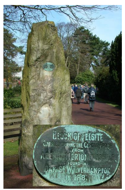
Glacial erratic with 1881 plaque

Several large granite, gneiss, conglomerate and felsite boulders, (recorded as part of the BCGS 'Boulderdash' study), survive today as a legacy to the 1881 exhibition. Letters dated from approximately 1879 show that the boulders were enthusiastically donated by local people from across the Black Country. Graham pointed out that not only do these boulders hint at Victorian interest in