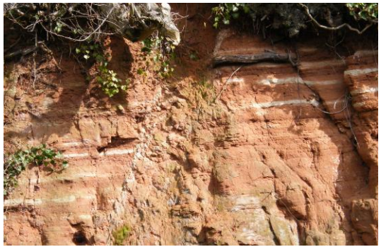
Wildmoor Sandstone in Tettenhall

Our next stop was 'The Rock' at Tettenhall, where an ivy covered exposure of the Triassic Wildmoor Sandstone Formation occurs (formerly Upper Mottled Sandstone). This forms the north-east to south-west trending ridge, and also underlies West Park. It is red and laminated with pale leached bands. It was deposited under tropical conditions by meandering streams flowing northwards into the Staffordshire Basin, and the leached bands and spots result from iron reduction during diagenesis. The Tettenhall pumping station borehole records the thickness of this Formation as 500 feet (130m). Unconformably approximately overlying this formation is the Bromsgrove Sandstone