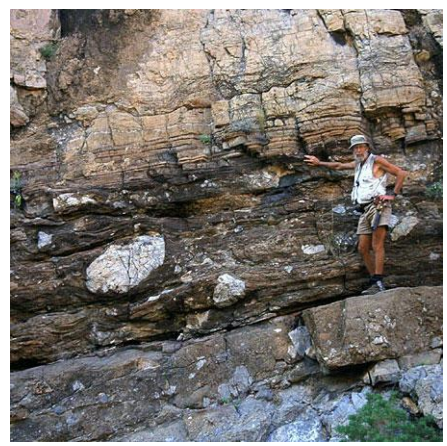
*Boulders dropped by icebergs

snow \Rightarrow more albedo \Rightarrow lower temperatures over a wider area \Rightarrow more snow. There is also the role of carbon dioxide that as a greenhouse gas raises temperatures. It is removed from the atmosphere during the chemical weathering of silicate minerals. During the Quaternary glaciations the bulk of the continental masses were in the cold and temperate latitudes, and once covered in ice, chemical weathering ceased so leaving more CO_2 in the atmosphere to help counter the lowering of temperatures. If, however, the bulk of the continental masses are in tropical latitudes, in a glaciation, this extraction of CO_2 by weathering would continue much longer. The Earth could be completely covered by snow and ice and temperatures could drop to -50°C, which is the proposed scenario for snowball Earth.