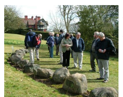
Boulders at Wightwick Manor