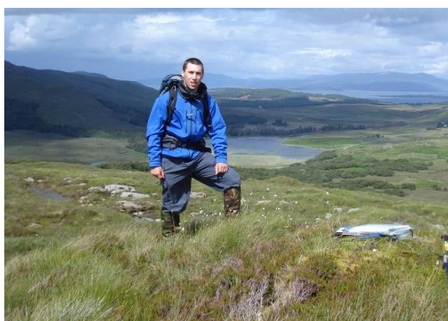
A Geologist, outstanding in his field.

Recently, a revolutionary new reality TV show has taken the world of TV by storm. It has been creatively called "I'm a geologist... Get me out of here". The geological reality show is based around the danger and excitement of volcanologists smashing hot lava with their rock hammers. The overall plan was to film a pack of geologists completing rock hammer trials, and voting off a member each week. The trials include trilobite racing, brachiopod boxing, sediment slapping, glacier surfing and of course, high risk colouring in. Each week a democratic vote decides which geologist leaves the "field" based on their willingness to face certain danger. The remaining "Hard Core Geologist" would win the title, King of the Rock Tappers .