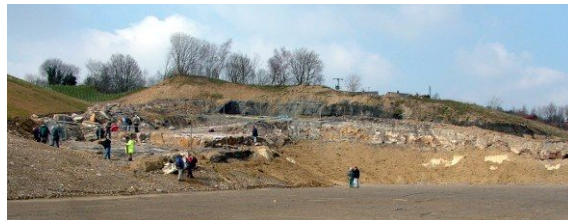
Brymbo Fossil Forest (in 2007)

This joint trip with the North Staffordshire Group of the Geologists' Association (NSGGA) saw members of both groups meeting at the gates of the site on a drizzly, grey Saturday morning at 11:00 am. Although a first time visit for NSGGA members this was a return for BCGS members for a chance to catch up on the continued conservation work at the site.