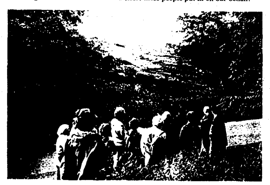
Fig. 2. A BCGS evening field meeting at a local Triassic exposure near Stourbridge.

The present membership of the BCGS is basically a group of people brought together by their interest in geology. It includes people who studied geology at university or at more modest level, people whose jobs bring them into contact with geology (civil engineers, teachers, water supply, foundry and other engineers) and people who have developed an interest in geology from love of countryside, from collecting specimens or from seeking an academic study. The Society runs a programme of lectures, given in Dudley, and field meetings within a reasonable day's travelling distance. As the Society does not have close contact with an academic or other institution, it relies for lecturers and leaders on the goodwill of local bodies. We receive much help from local universities and polytechnics, from museum staffs, from local companies with a geological interest, from public bodies, and from many other sources. We are very grateful for the time and effort these people put in on our behalf.