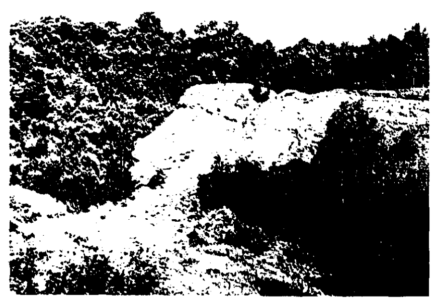
Fig. 1. Doulton's Claypit SSSI (Site of Special Scientific Interest), an important Black Country geological and wildlife site.

the fact that its inaugural meeting was addressed by Sir Roderick Murchison, who travelled to Dudley specially for the purpose. This society was re-founded in 1862, and it carried on until early in this century, when it appears to have died out.