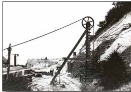
Wren's Nest mine c 1900