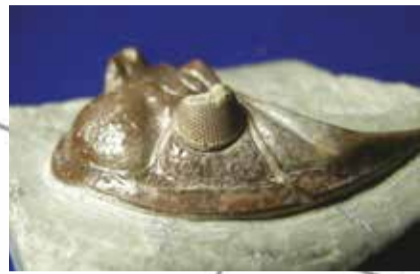
Dalmanites - trilobite head