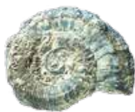
Poleumita, a gastropod or early sea-snail

The first Abraham Darby, the father of the industrial revolution, was born at Wren's Nest in 1678 and reputedly learnt the secrets of how to smelt iron with coke from his great uncle Dud Dudley. The Darbys later moved to Coalbrookdale in Shropshire to develop these techniques and went on to construct the famous Ironbridge in 1781. Wren's Nest has numerous archaeological points of interest including several early lime pyes for burning limestone which date from mediaeval times and some