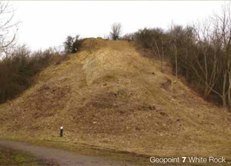
Geopoint 7 White Rock