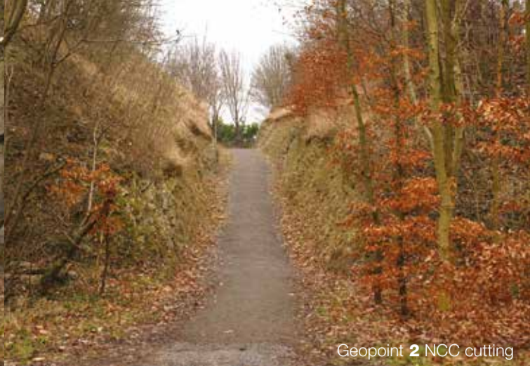
Geopoint 2 NCC cutting