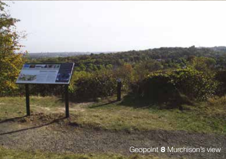
Geopoint 8 Murchison's view