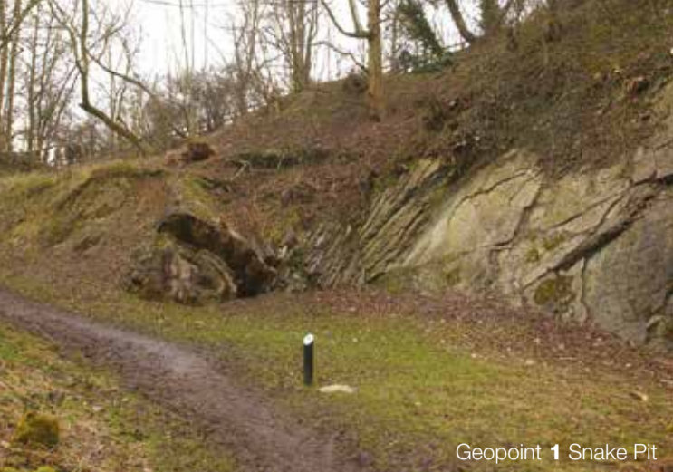
Geopoint 1 Snake Pit