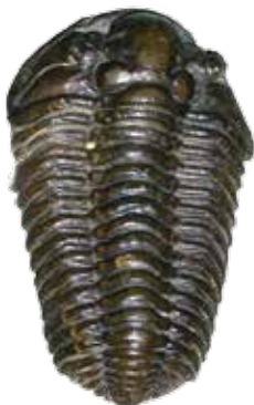
Calymene blumenbachii The Dudley Bug

At Wren's Nest it is easy to find fossils in the loose material on the floor of the quarries and in the fossil trench. The types of fossil that can be found include compound corals such as chain coral, solitary 'rugose' corals, sea lilies or crinoids, and abundant brachiopods. Trilobites are probably the most famous of our fossils, especially the 'Dudley Bug' as nicknamed by quarrymen in the 19th century. These look