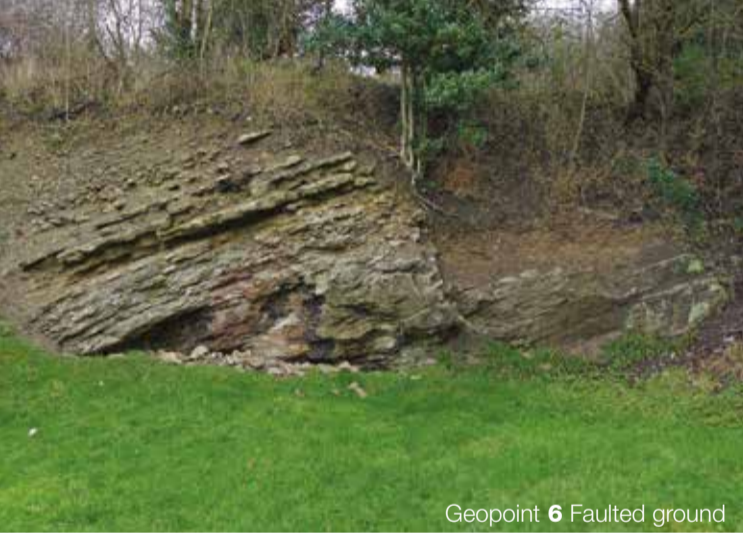
Geopoint 6 Faulted ground