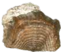
Leptaena depressa a common brachiopod

a bit like modern woodlice but are actually more closely related to crabs. Several types of brachiopod or seashell can be found. These were more prevalent in Silurian times than modern-day bivalves like oysters and mussels. Occasionally you can find a gastropod or early sea snail. Ammonites appeared much later in the fossil record during Cretaceous and Jurassic times and cannot be found at Wren's