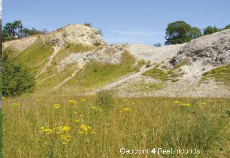
Geopoint 4 Reef mounds