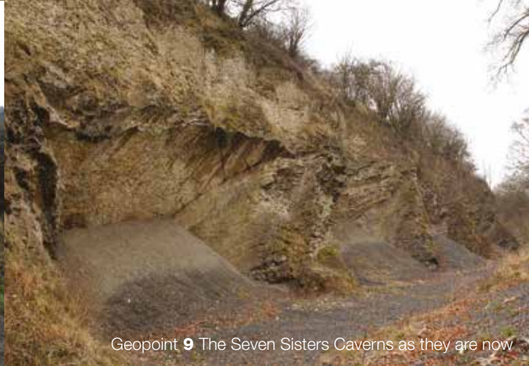
Geopoint 9 The Seven Sisters Caverns as they are now