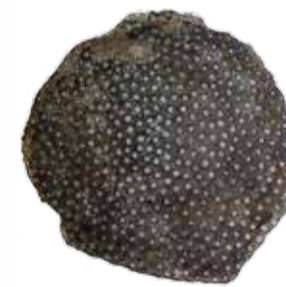
Helleolites - coral