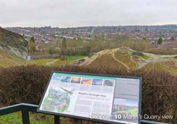
Geopoint 10 Marsh's Quarry view