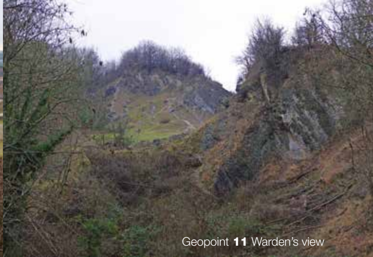
Geopoint 11 Warden's view