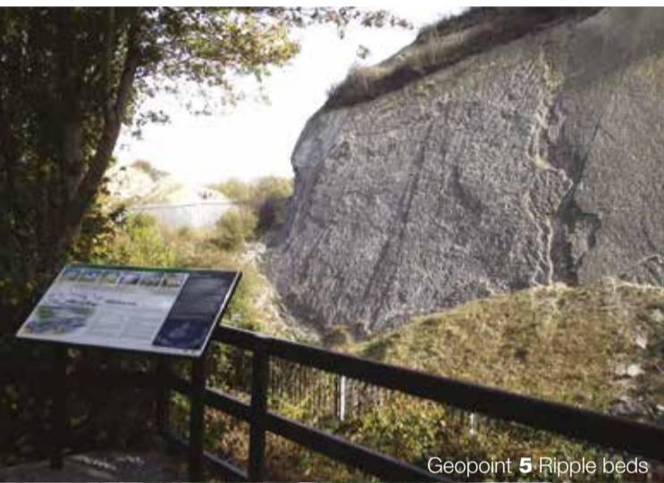
Geopoint 5 Ripple beds