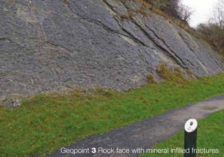
Geopoint 3 Rock face with mineral infilled fractures